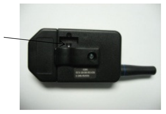
Switches are located on back side of transmitter, on side opposite the antenna, under a small plastic cover. Use the end of a pen to change the position of one or more of the switches.

In the LRN Menu, under SET-UP, hold down Green ▶ button for 5 seconds and wait for countdown to begin. Press and hold any button on the remote transmitter. When DONE flashes in the display, the transmitter is programmed.