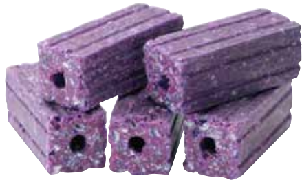
Photo is not representative of a label-consistent bait placement