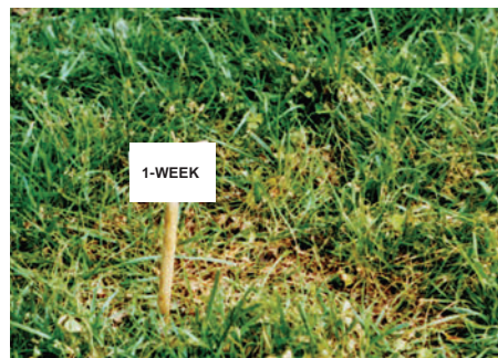
As shown in these before and after photos, SpeedZone eliminated clover from this lawn in 1-week.