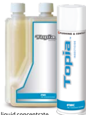
1-quart liquid concentrate

For the ultimate in convenience and flexibility, the natural pest-fighting power of Topia is available in a liquid formulation as well as a non-flammable, water-based aerosol, which is compatible with the CB ® Aerosol Delivery Unit.