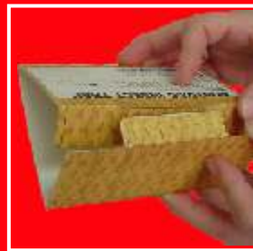
Tuck Tab to Assemble