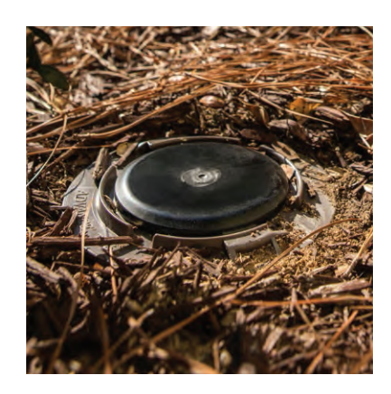
The in-ground housing of the station is secured with a quik-lock cap.

After bait stations are found by termites, they work to provide ongoing structural protection through termite colony elimination.