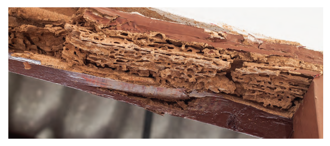
Termite damage to wood